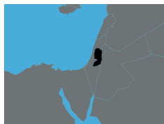
Palestine (West Bank)

Ruwwad is a non-profit organisation that works with marginalised neighbourhoods and communities in Lebanon, Jordan, Egypt and Palestine (the West Bank) through education and youth volunteering. Young people from the neighbourhoods are offered scholarships in return for volunteering in their community, for example, teaching children.