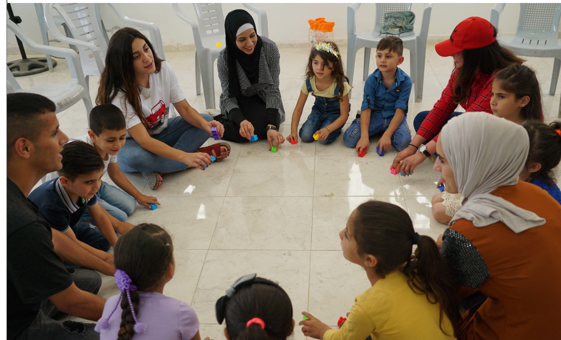
Budrus/Qibye - the Westbank

Read the newsletters about our work in Palestine (West Bank)