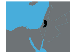
Palestine (West Bank)

Read the newsletters about our work in Egypt