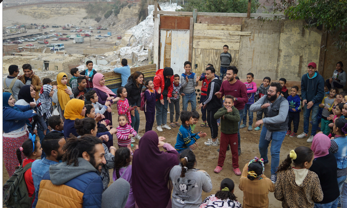
El Ezbah - Cairo

Since the beginning of the Covid-19 measures, together we have explored the transition to an online training programme. It start-