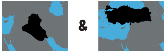
Northern Iraq/Kurdistan Turkey

Sounds of Change has partnered with organisation SPARK since 2019. SPARK provides (vulnerable) students, especially women and refugees, with scholarships in the Middle East, North Africa and sub-Saharan Africa and Europe. Their goal is to provide them with access to the labour market and tools to rebuild their own country, mainly Syria. A major emphasis is on self-employment. Sounds of Change focuses its training on creative leadership and everything that comes with it to benefit their own entrepreneurship. It's important to create a safe climate for people to express themselves and be seen and heard.