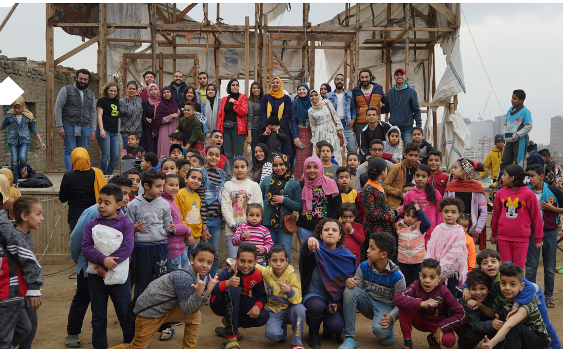
El Ezbah - Cairo

“It was about music with a message, about collaboration between people, our life style and our difficulties. In these activities we can do it with children or youth. We can learn a lot about people, about how they learn, about their life, without asking direct questions. Because they might be shy and afraid to share. In these activities we can do what we want in a good way.”