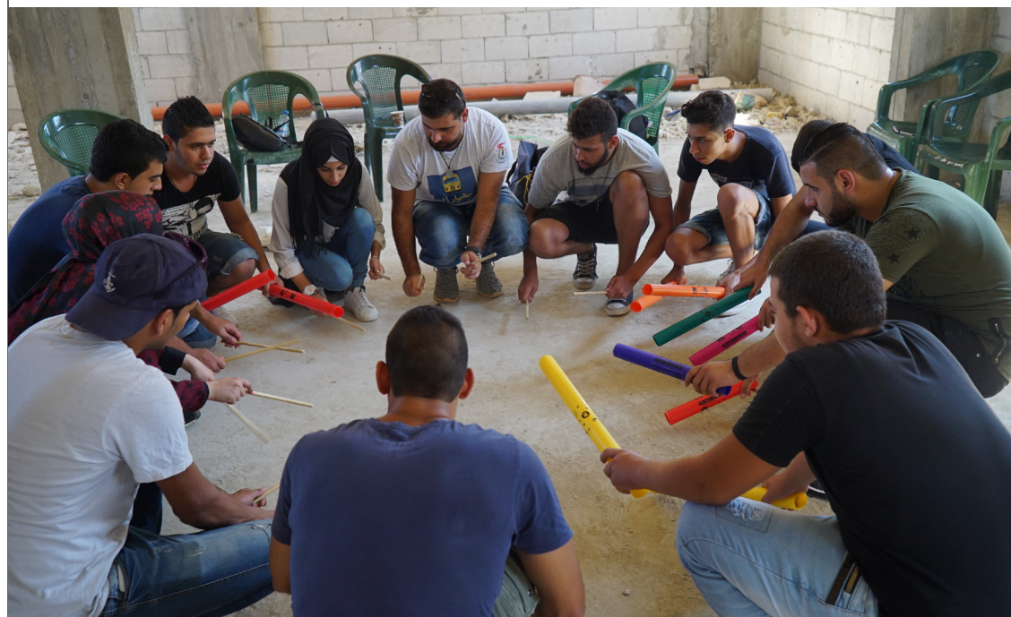
Nahr el Bared camp - Lebanon

Read the newsletters about our work in Lebanon