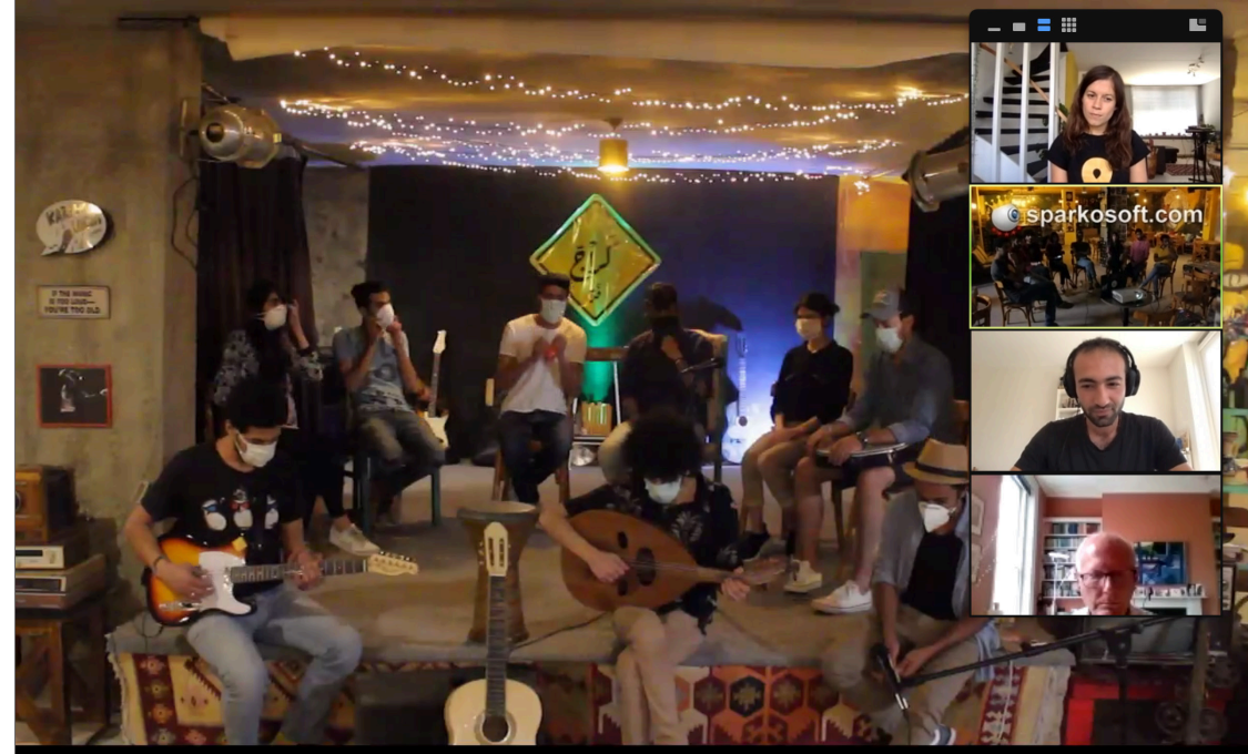
Irbid - Jordan