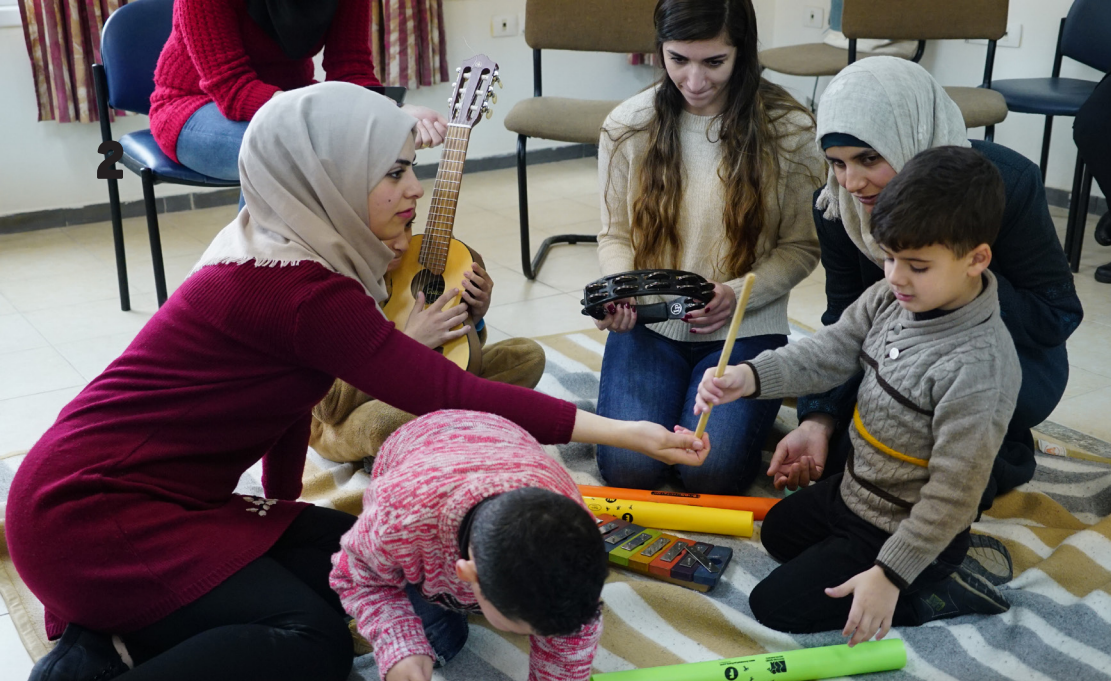
Budrus/Qibye - the Westbank

"This week I'm celebrating myself and my craziness again. I felt like everyone left his masks that we had outside and showed his true self".