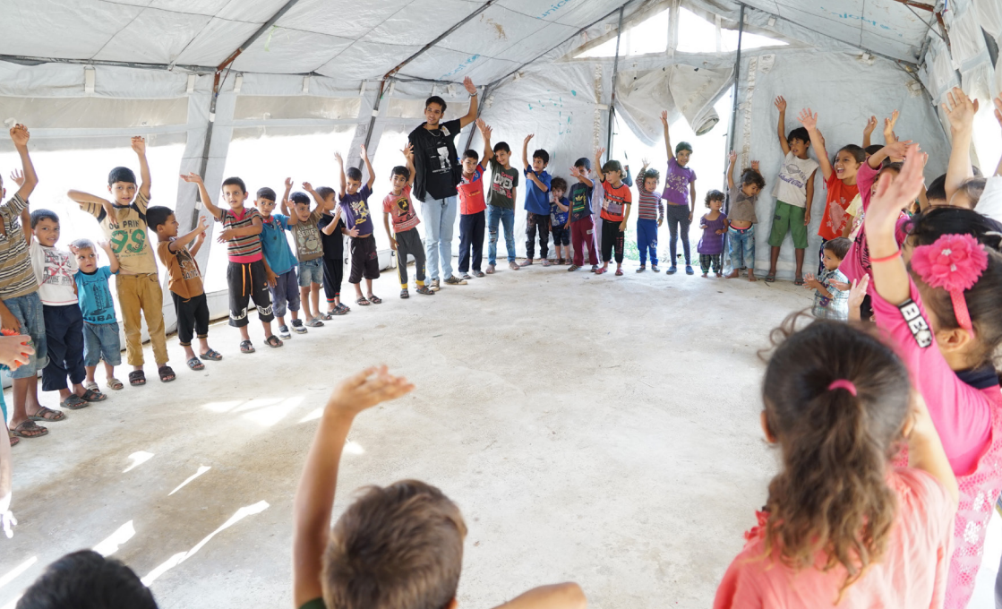
Nahr el Bared camp - Lebanon

“The training was really special. Because it presented a new way of connecting with each other, of listening to each other. We started to know which is the best way to work as one team. Just like the counting game we did. At first we weren’t listening, not waiting and not focussing. But then we started to gradually improve until we counted to ten, and it became successful. I hope we will carry on with that.”