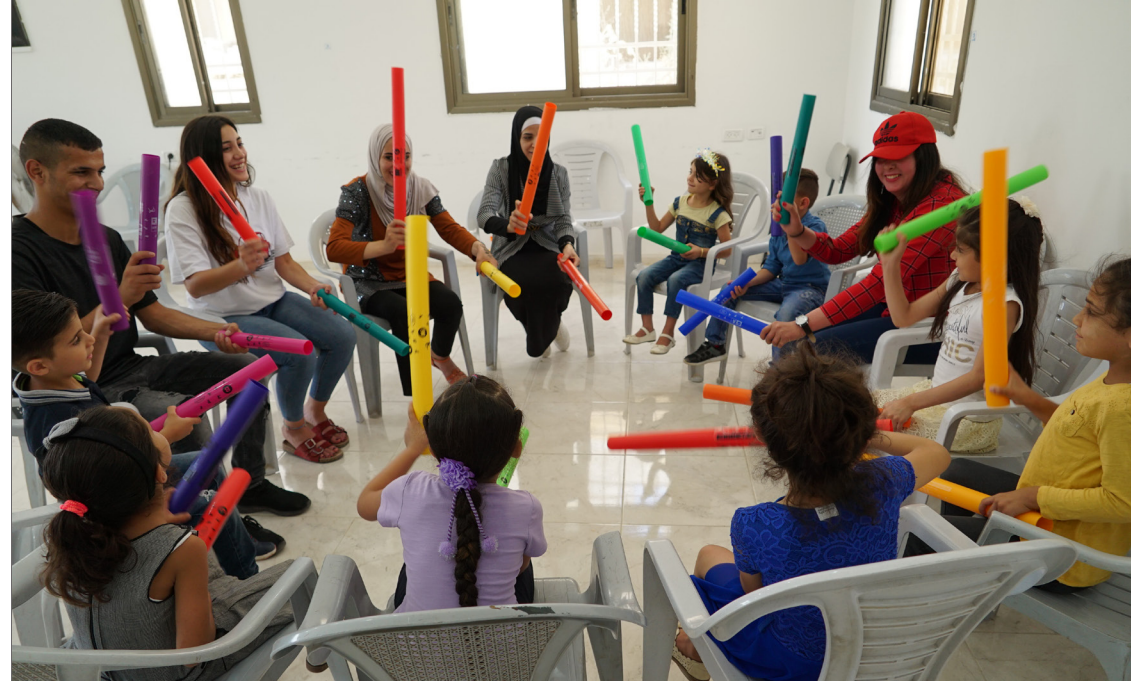
Budrus/Qibye - the Westbank

train first-year students in our working methods. In this way, they deepened their leadership skills and, through peer learning, we can help a new group of students to integrate our techniques into their programmes for children and young people from the community.